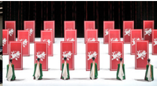
Cultural Music Event Thursday, August 21, 2025, 08:00 PM - 09:30 PM Sejong Center for the Performing Arts