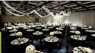
Gala Dinner Wednesday, August 20, 2025, 7:00 PM - 9:00 PM Grand Ballroom, Grand Intercontinental Seoul Parnas