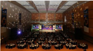
Welcome Reception Monday, August 18, 2025, 6:30 PM - 8:30 PM Hall D, COEX