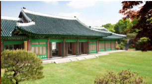
Thank You Party Tuesday, August 19, 2025, 7:30 PM - 9:00 PM Yeong Bin Gwan, The Silla Hotel Seoul (Invitation Only)